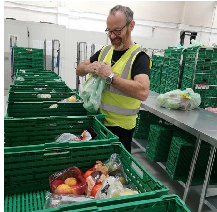
Above- fruit and vegetables being sorted at one of our warehouses